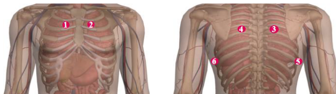
Fig. 1. Positions to acquire lung sounds (left image represents an anterior view and the right image represents a posterior view). The selected position are 1 and 5. Both images were taken from [9].

After testing the other three positions (1, 3 and 5), it was possible to conclude that position 1 presented higher amplitudes, regarding heartbeats. This is due to position 1 being near to position 2 and, consequently, near the heart (when compared to positions 3 and 5). Although positions 3